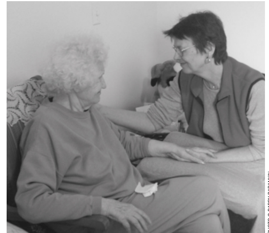
When the practitioner is at same level as the client, it promotes eye contact and connection that helps build rapport. It is another way of accessing the arm, shoulder and upper back of a client. The pillow serves as a bridge as well as a boundary.

According to the latest statistics from the Alzheimer’s Association, AD is now the fourth-leading cause of death in adults, affecting nearly four million Americans, and eight million more people worldwide. Age is the biggest risk factor for AD. The number of cases of Alzheimer’s disease doubles every five years in people aged 65 and older. By age 85, nearly half of all people are afflicted. As the aging population increases, unless more effective methods for prevention and treatment are developed, it is estimated that Alzheimer’s disease will reach epidemic proportions, afflicting 14 million Americans within 50 years. One physician has gone so far as to say that, “In 25 years, the United States will have two kinds of people: those who have Alzheimer’s and those who are caring for someone with Alzheimer’s.” 1